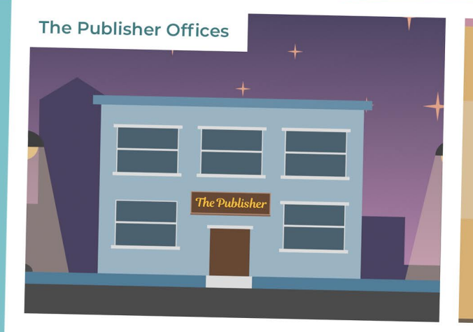
We also don't think about the environment, too much trees are dying for our ads...